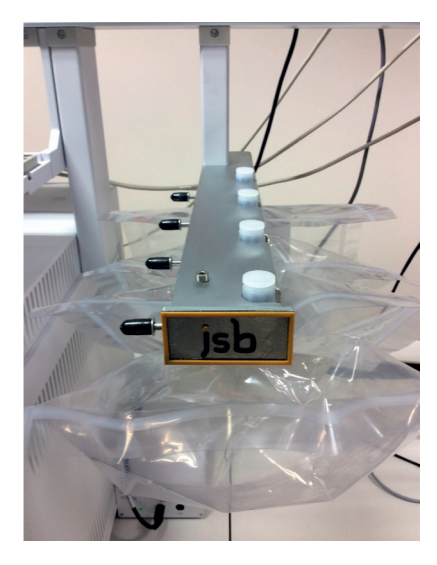
The gas sampling bag module.