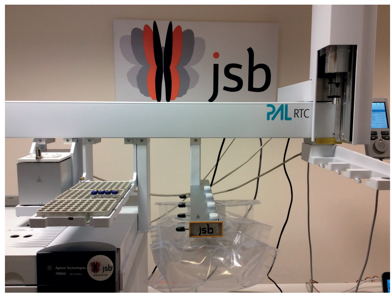
One 4 bag module mounted on a PAL.