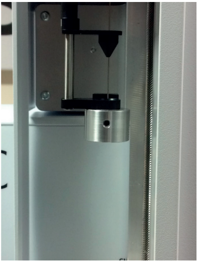
Adapter for syringe tool.