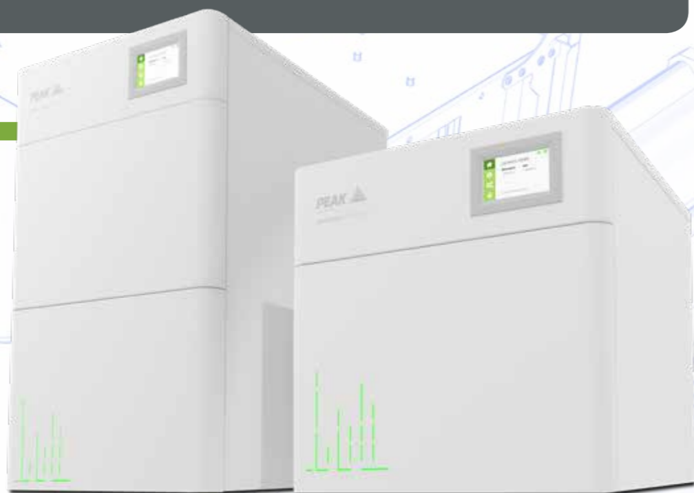
Genius XE 70

There are two models to suit your flow requirement, Genius XE 35 (up to a total of 35 L/min) and Genius XE 70 (up to a total of 70 L/min), both sharing many of the unique benefits with the main differences being size, number of internal compressors (2 and 4, respectively) and of course total output flow. The XE 70 is ideally suited to serving multiple instruments, eg. 2 or even 3 mass-spectrometers from one compact footprint solution.