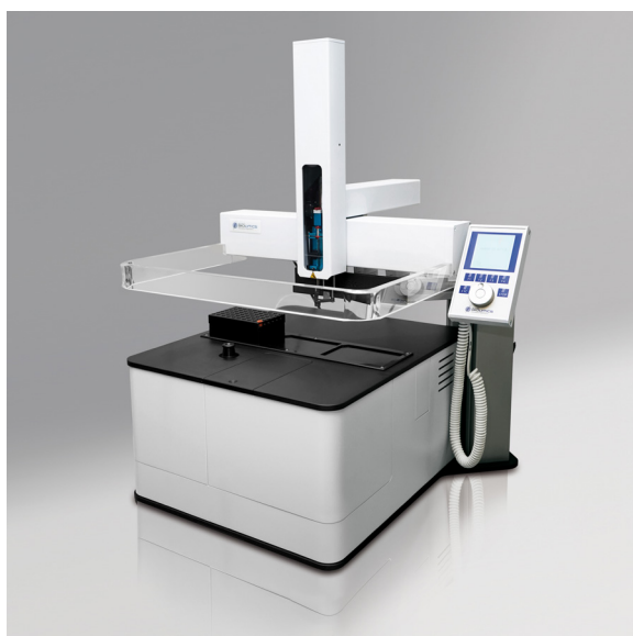
Fig. 1: Automated MIRA Analyzer

Flow-through cells to measure transmission are common in infrared spectroscopy. Liquid test samples are directed through such cells using inlet and outlet channels and passed through an optical measuring chamber, which is separated by infrared-transparent windows. The MIR transmission spectroscopy methods presented here are performed with a precision flow cell manufactured using microsystems technology, which use defined light paths of under 10 \mu\text{m} and are pressure resistant. The measuring cell ensures light path accuracy better than 1 nm. This special flow cell design allows for the reliable analysis of aqueous samples ( http://micro-biolytics.com/en/technologie/ ). The full potential offered by mid infrared spectroscopy can now be realised in combina-