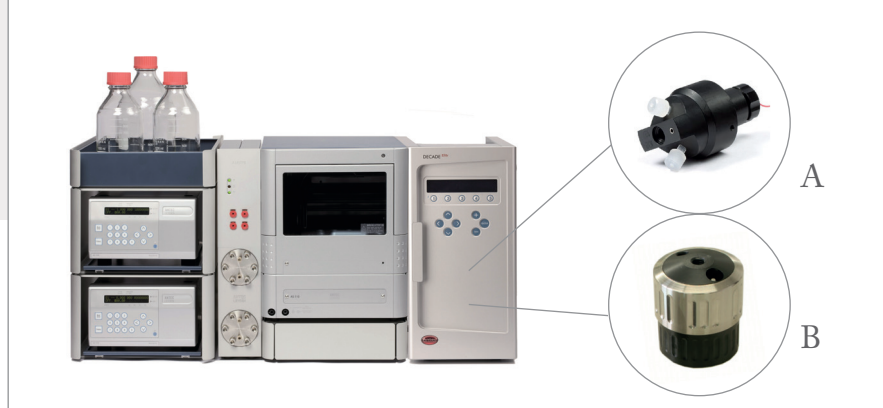
Figure 2. ALEXYS Antibiotics Analyzer for aminoglycosides and macrolides antibiotics analysis, based on RP-HPLC or HPAEC with PAD (3 or 4 steps) detection. Inserts: (A) FlexCell (routine use) and (B) SenCell (in case of EP/USP requirement). Sensitivity FlexCell 100 nmol/L, SenCell 10 nmol/L.

Two types of electrochemical flow cells are available: The FlexCell with easy